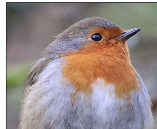
A friend I met last week!

The Divine Mercy Prayer Group is now meeting again at St John's every Friday at 2:00 pm